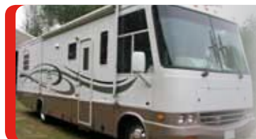
Motor Homes / Recreational Vehicles