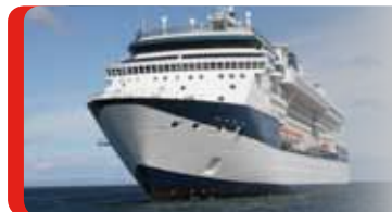
Cruise Ship / Large Vessels